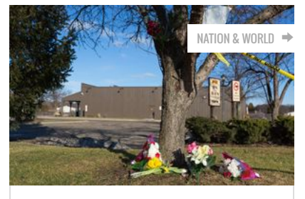
Michigan university to review alert policy in wake of Kalamazoo...