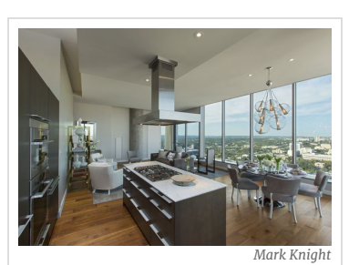
Turn-key residences at the W are expected to appeal to F1 attendees looking for a second home