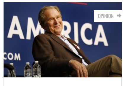
Facebook comments: Feb. 23, 2016