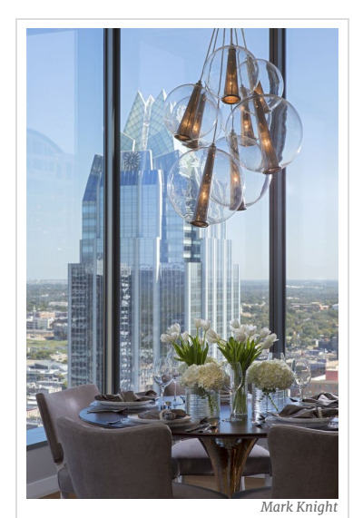
The W has 159 condos. A dining area offers a look at the downtown skyline