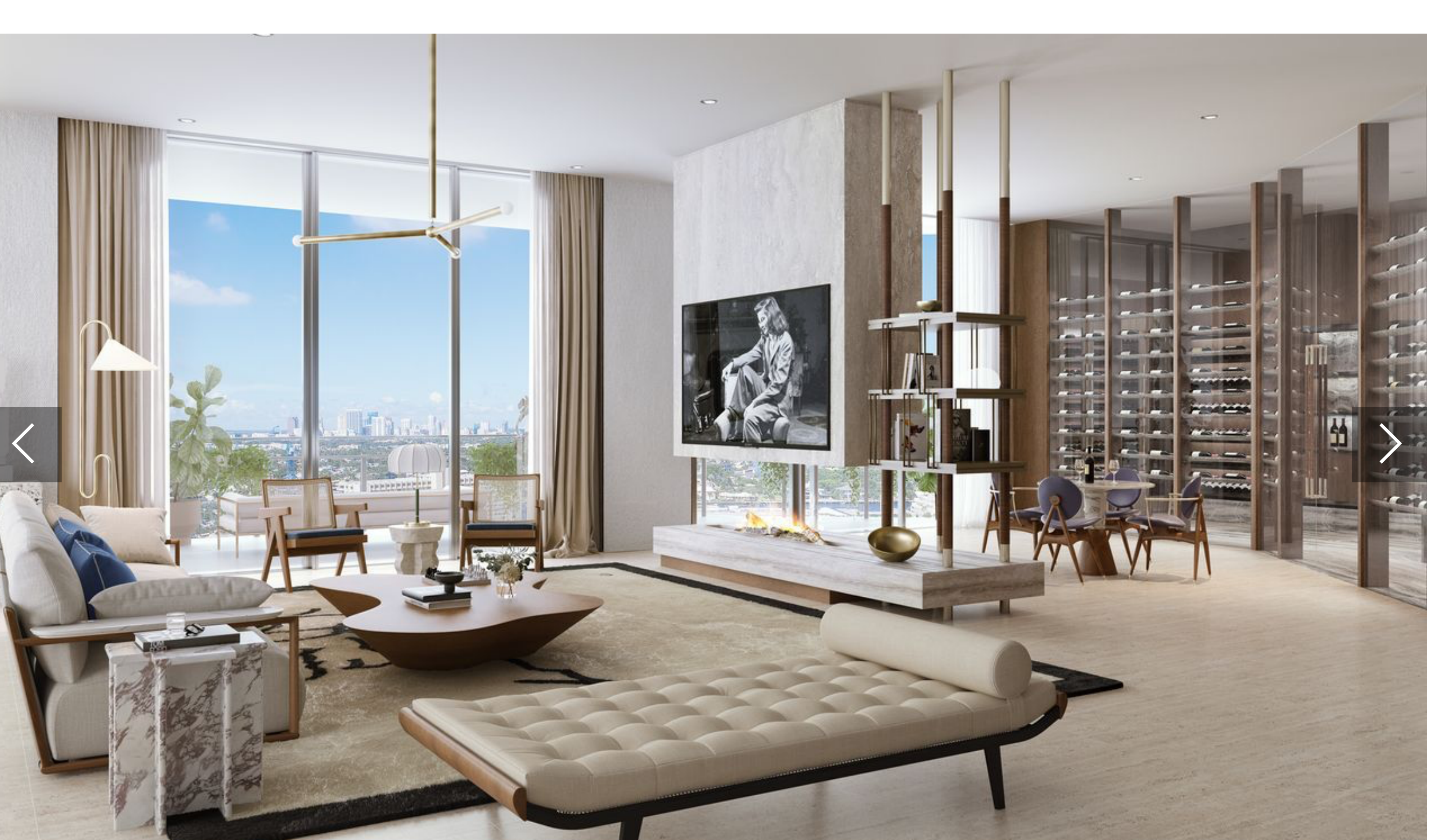
A penthouse at the Four Seasons Private Residences Fort Lauderdale has found a buyer for $15.4 million, the most expensive recorded condo in the South Florida city.